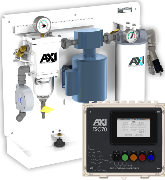
FPS SX-F with upgraded TSC70 Touchscreen Controller

The FPS SX-F is a programmable, fully automated, fuel maintenance system that removes water, sludge, and other contaminants from fuel storage tanks. Once installed, the FPS SX-F system operates independently to ensure fuel reliability through routine fuel filtration. The system's fuel polishing process stabilizes diesel and bio-fuels, eliminating microbial contamination and ensuring the fuel remains clean. These compact fuel maintenance systems are specifically designed for permanent installations indoors, as well as confined spaces, such as inside gen-set enclosures or engine rooms.